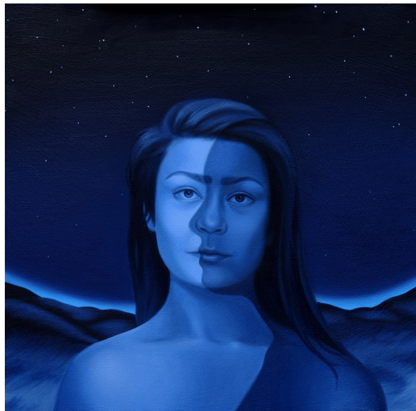
Duality of the Self, 2021